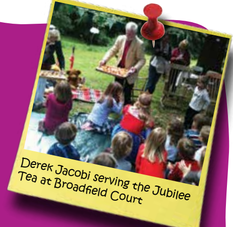
Derek Jacobi serving the Jubilee Tea at Broadfield Court