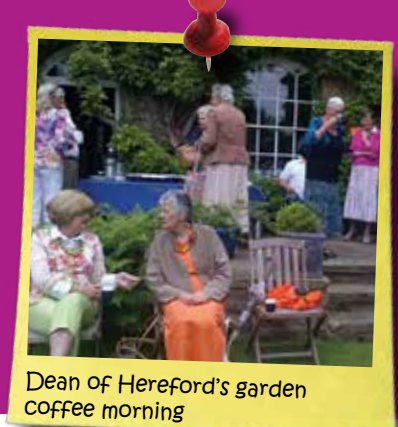
Dean of Hereford's garden coffee morning