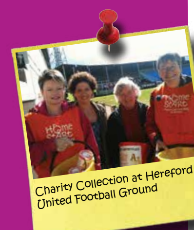
Charity Collection at Hereford United Football Ground

Home-Start Herefordshire were lucky enough to get our application in early to be the charity at the 2011 Food Festival held at the Racecourse... there were lots of tasty delights to eat, as well as one tasty delightful chef to meet. We were able to recruit a few new volunteers and raised £354 during this weekend.