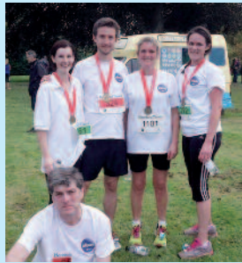
Hereford Festival of Sport 2015 saw a team from HSH raise £2,520.22

A big thank you to all who took part and to everyone that sponsored us in our efforts. In total our fundraising events raised £4,762