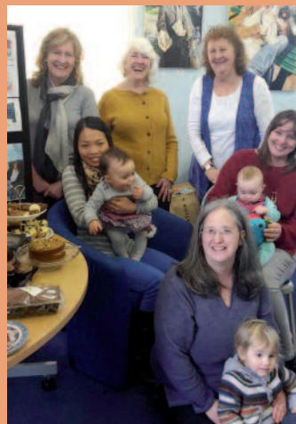
Coffee morning in Kington