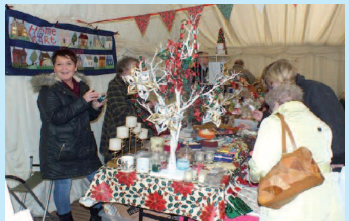
Christmas Craft Fair at Broadfield Court

2015/16 has been yet again a great year of different fundraising ideas and events.