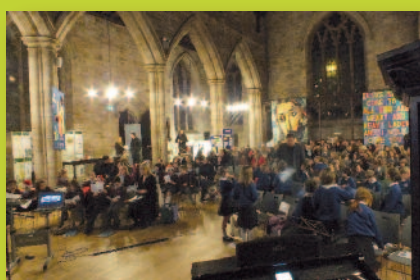
Christmas Carol Service