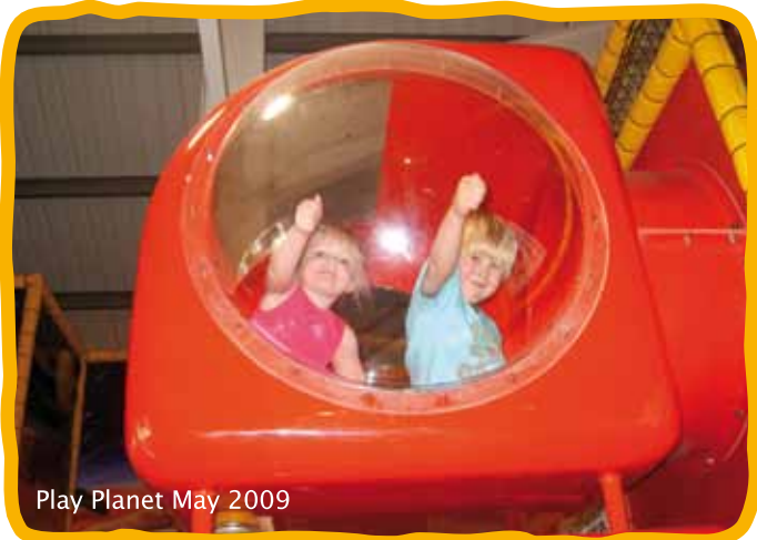
Play Planet May 2009