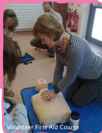
Volunteer First Aid Course