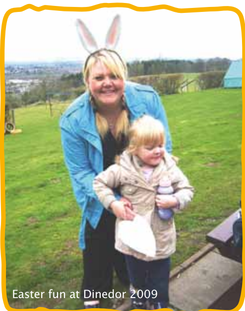
Easter fun at Dinedor 2009