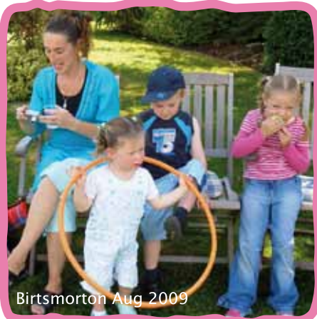
Birtsmorton Aug 2009