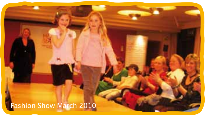
Fashion Show March 2010