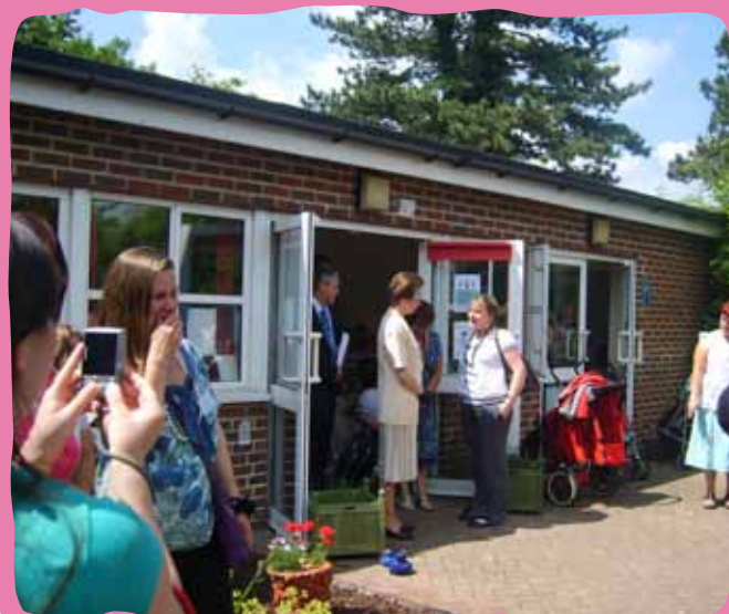
Princess Anne's visit to the Toy Library