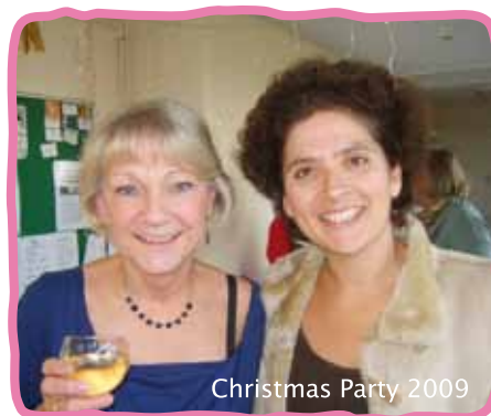
Christmas Party 2009