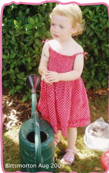
Birtsmorton Aug 2009