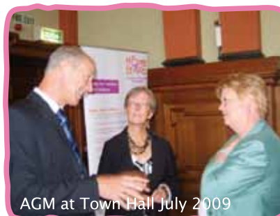
AGM at Town Hall July 2009