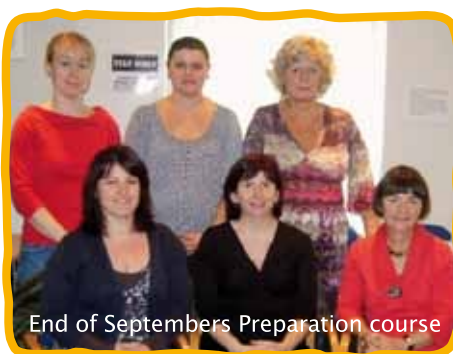
End of Septembers Preparation course