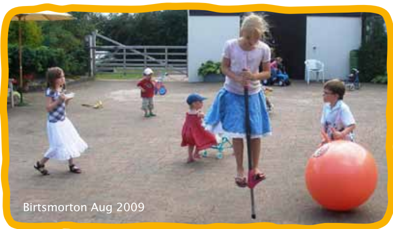
Birtsmorton Aug 2009