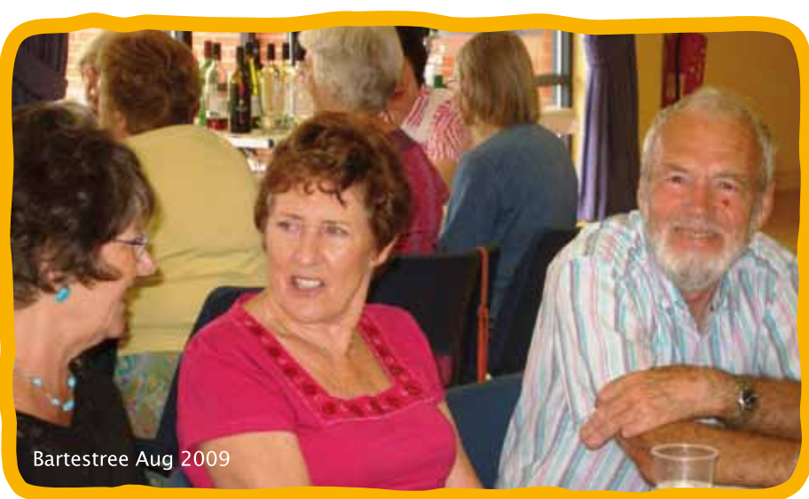
Bartestree Aug 2009