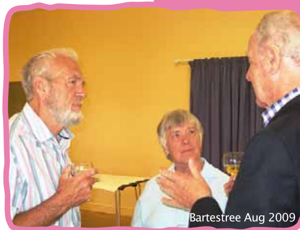
Bartestree Aug 2009