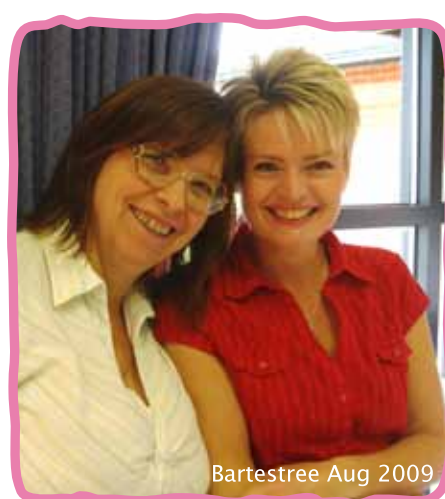
Bartestree Aug 2009