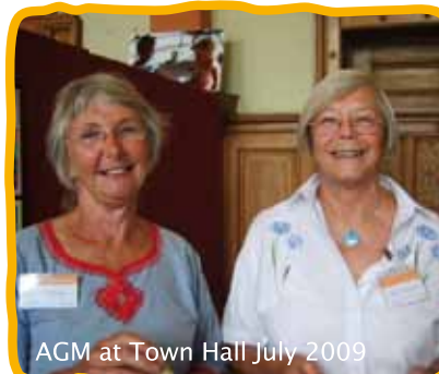
AGM at Town Hall July 2009