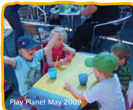
Play Planet May 2009