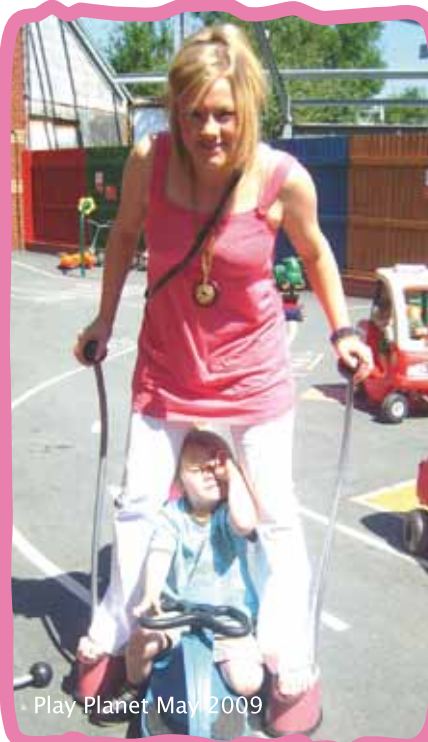
Play Planet May 2009