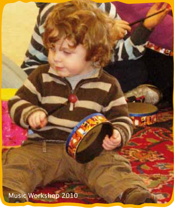
Music Workshop 2010