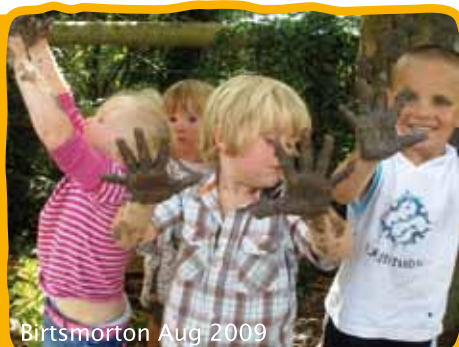
Birtsmorton Aug 2009