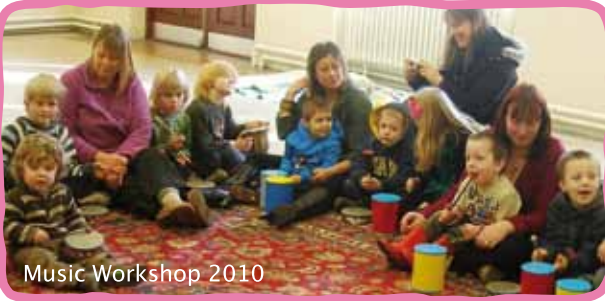
Music Workshop 2010