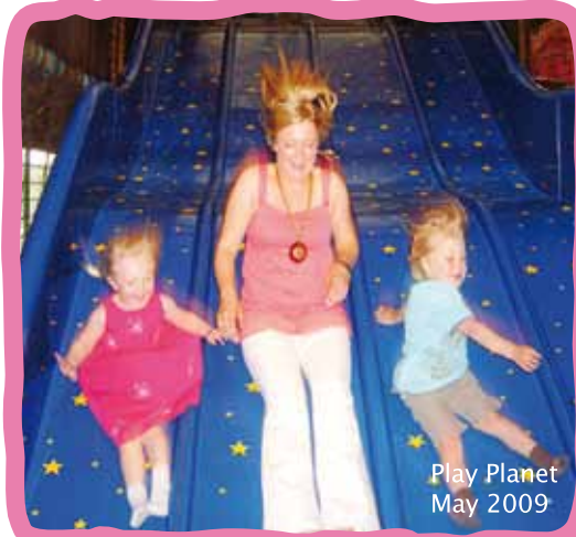
Play Planet May 2009