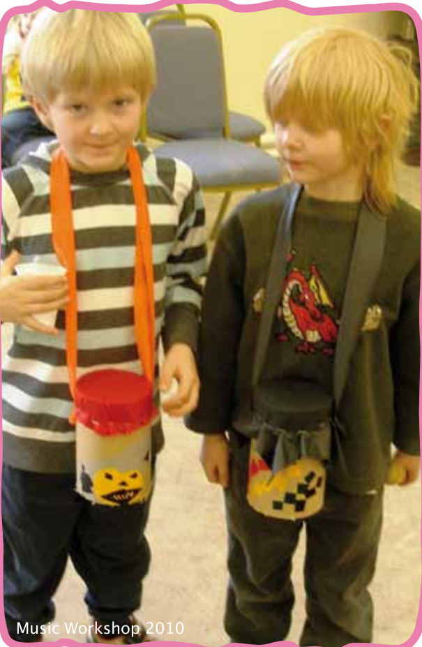
Music Workshop 2010